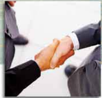
Energy Tax Savers