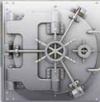
De Lage Landen